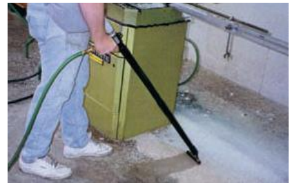
Model 6192 Vac-u-Gun Collection System with bag vacuums absorbent and chips.