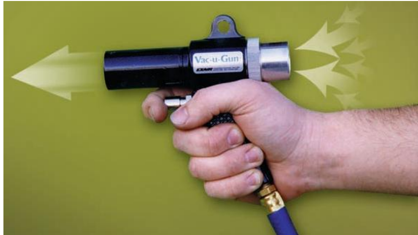
In blow mode, the Vac-u-Gun consumes less air than ordinary blow guns.

Reverse the direction of the nozzle insert to change from vacuum to blowoff.