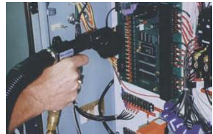
Model 6292 Vac-u-Gun Transfer System carries dust away from sensitive electronic controls.