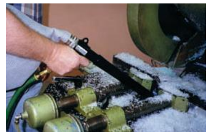
Model 6392 Vac-u-Gun All Purpose System removes plastic shavings from a saw.