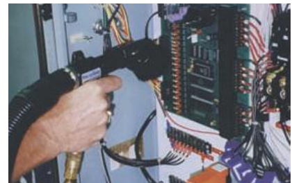
Model 6292 Vac-u-Gun Transfer System carries dust away from sensitive electronic controls.