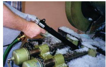
Model 6392 Vac-u-Gun All Purpose System removes plastic shavings from a saw.